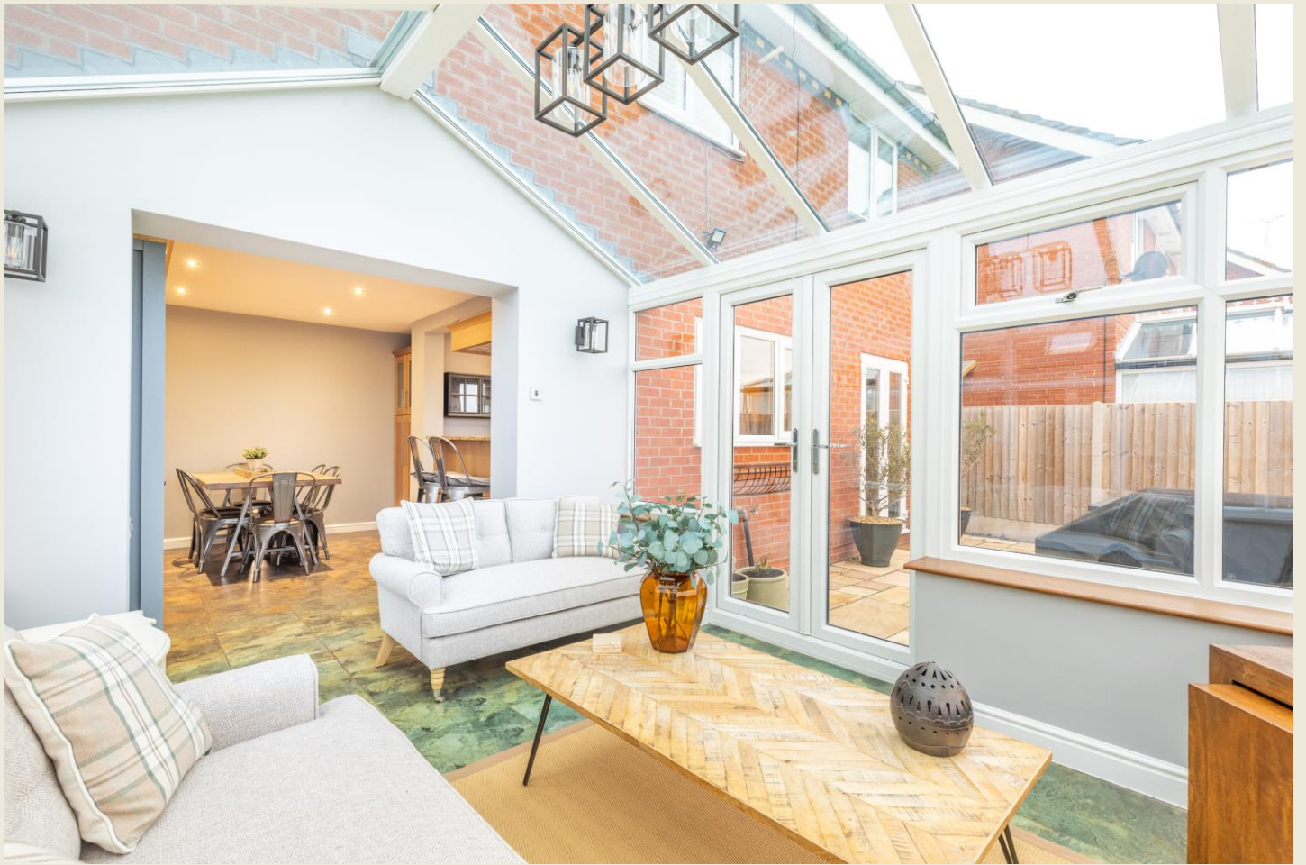
CONSERVATORY 12'1 x 9'5