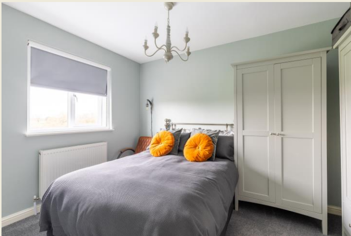
BEDROOM THREE 12'0 x 8'11