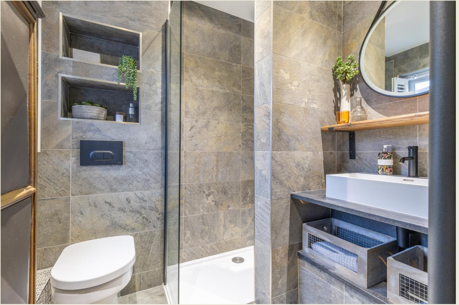
ENSUITE SHOWER ROOM 7'3 x 5'9