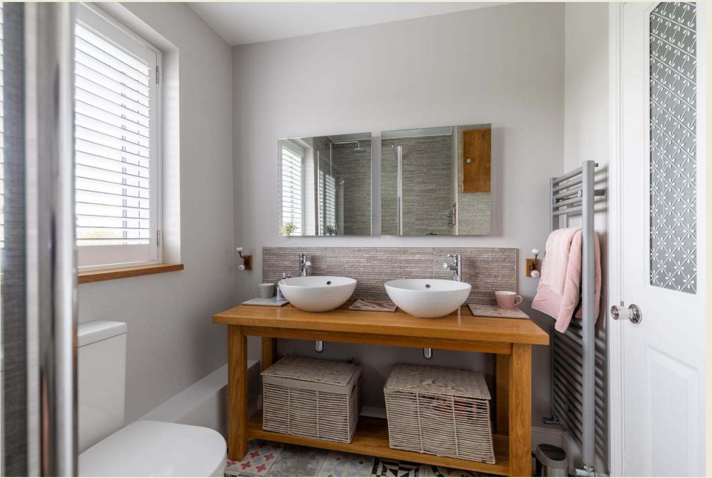
FAMILY SHOWER ROOM 7'9 x 6'6