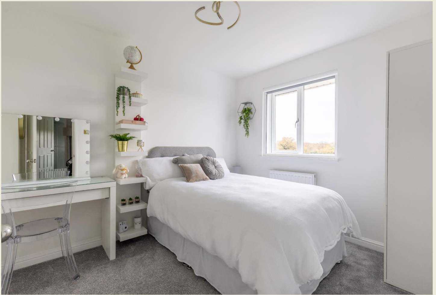
BEDROOM TWO 13'7 x 9'0