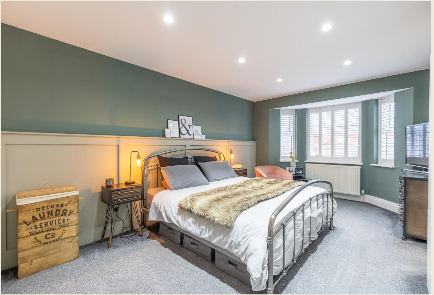
MASTER BEDROOM ONE 19'4 x 11'5