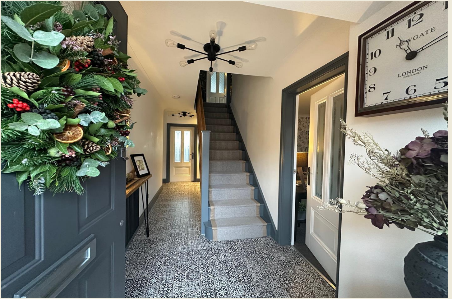
ENTRANCE HALL 17'5 x 5'8