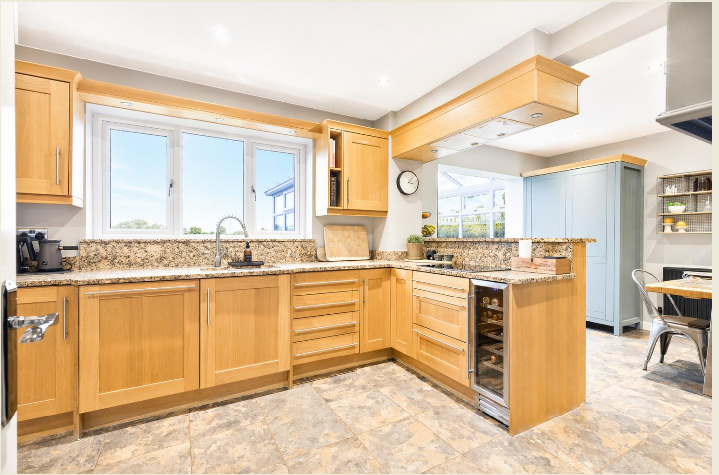
KITCHEN BREAKFAST DINING ROOM 26'3 x 13'0