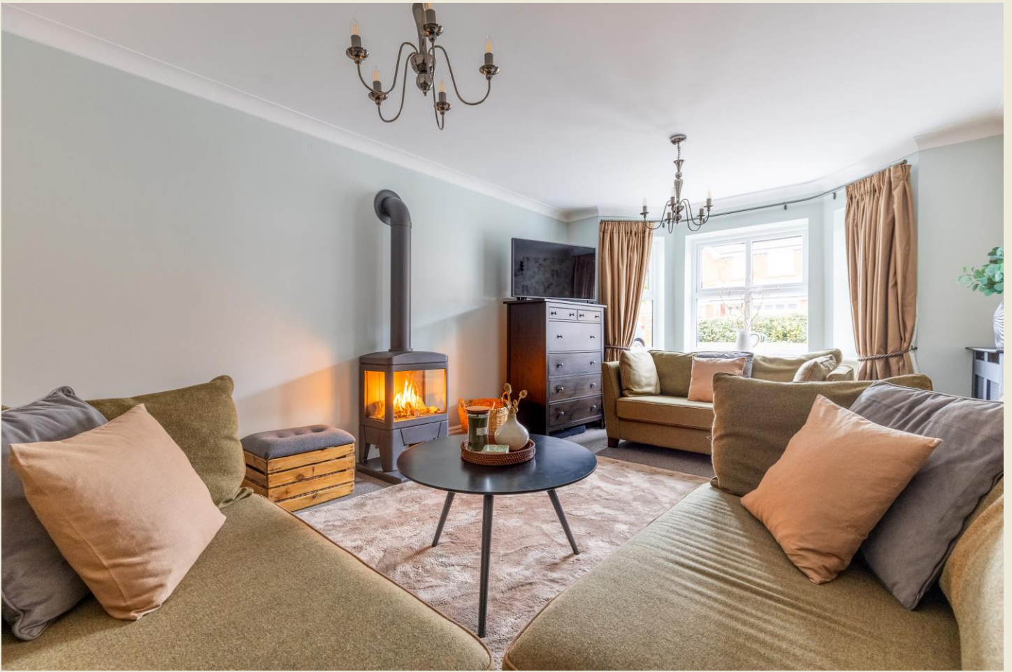
LIVING ROOM 17'11 x 11'7