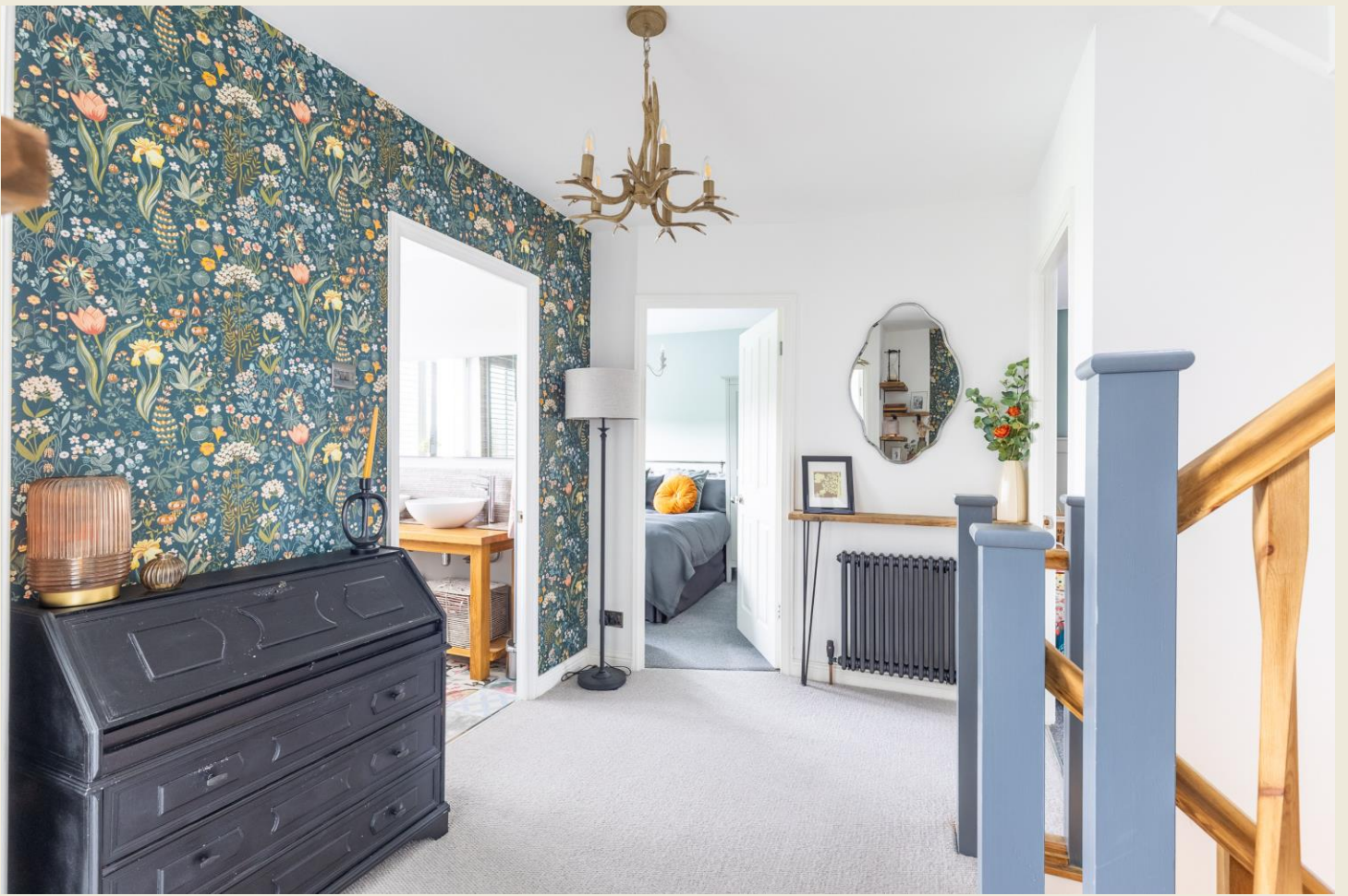
FIRST FLOOR LANDING 12'1 x 12'0